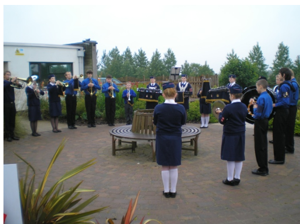
The band playing at the opening of the BB Memorial Garden at the National Arboretum

2 nd Sunday in the month 10:15am-11:30am