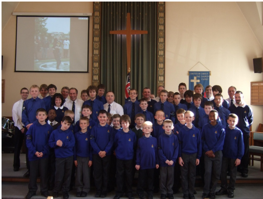
Junior and Company section awards evening, June 2009.

Our Company has been serving the young people of Solihull and Sheldon for 70 years and we are one of the largest companies in the Birmingham Battalion. Many of our members, past and present, have also gone on to achieve the Queens Badge award, the highest award available to Boys' Brigade members. Whilst we are very proud of our history we have a great desire to ensure our program is both dynamic and retains the interest of our members.